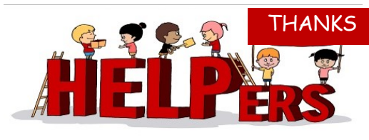
DONBURN PRIMARY SCHOOL NO. 5019 – CANTEEN ROSTER 2020